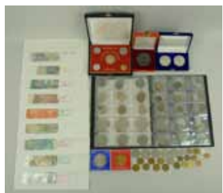
1223 A quantity of coins and bank notes including two Kuwaiti silver dinars, each one oz, various Middle East bank notes, and a Turkish gold 25 piastre coin, pendant mounted. £100 - £150