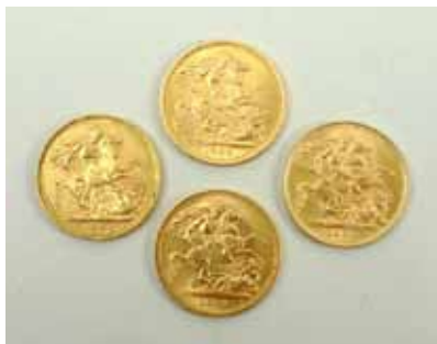
1236 A Victorian gold sovereign, dated 1892, and three Elizabeth II gold sovereigns dated 1958, 1965 and 1968. (4) £800 - £1000