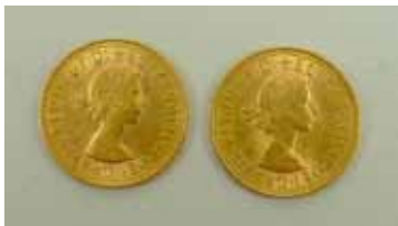
1233 An Elizabeth II sovereign 1957, and another 1958. £320 - £350