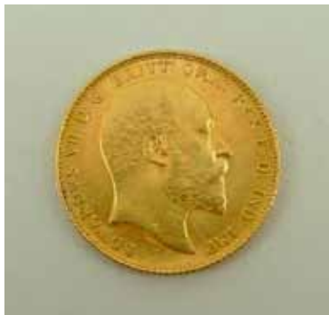
1225 An Edward VII sovereign, 1902. £160 - £200