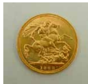
1230 A Victoria head sovereign, 1888. £160 - £200