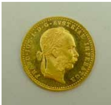
1224 An Austrian one ducat, restrike 1915, 3.5g. £100 - £150