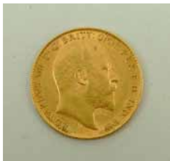
1221 An Edward VII half sovereign, 1910. £80 - £120