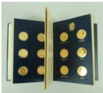
1232 A coin collection of 'The Churchill Centenary Medals', minted by John Pinches Ltd, comprising twenty four medals in presentation book, with certificate. £150 - £200