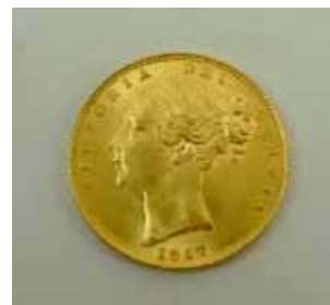
1229 A Victoria young head sovereign, 1857. £160 - £200