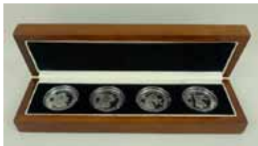
1220 A Coronation Anniversary Heraldic Beasts silver Crown set of four coins, circa 2013, boxed with certificate. £100 - £150