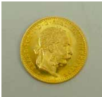
1238 An Austrian one ducat, restrike 1915, 3.5g. £100 - £150