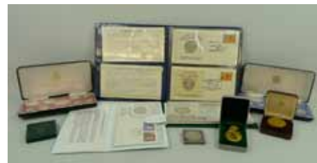
1228 A quantity of coins including four 'Great Britons' medallic first day covers, 1971 Jamaica, Trinidad & Tobago and Bahama Islands proof sets, The Test Cricket Centenary medallic first day cover, Virgin Islands proof set 1973, and a Birmingham Mint gilt Silver Jubilee Medal 1977. £100 - £150