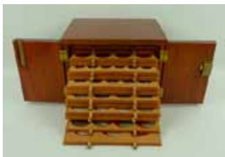
1219 A coin cabinet containing a quantity of silver and other coinage, some uncirculated, 22 by 18 by 18cm. £400 - £600