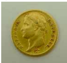
1235 A gold Napoleon Empereur Drott 20 francs 1814, Empire Francais. £150 - £200