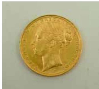
1222 A Victoria young head sovereign, 1885. £160 - £200