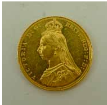
1239 A Victoria head sovereign, 1887. £160 - £200