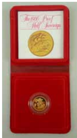
1237 An Elizabeth II half sovereign, 1980. £80 - £100