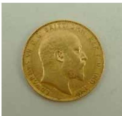
1226 An Edward VII sovereign, 1910. £180 - £200