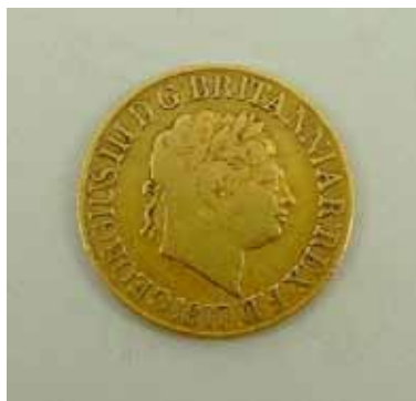
1240 A George III sovereign, 1817. £300 - £500