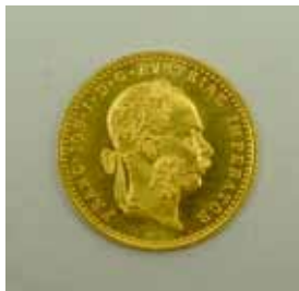
1234 An Austrian one ducat, restrike 1915, 3.5g. £100 - £150