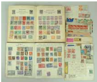
355 A quantity of stamps including an Improved Postage Stamp Album containing GB perforated and unperforated Penny reds, a Penny black and Two Penny blue, European and Dominions, and a quantity of loose stamps, mint and used in various small boxes and tins. £60 - £100