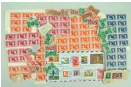
353 A quantity of postage stamps including George VI New Zealand mint blocks, 1d-6d, some overstamped for Niue and Cook Islands, used George V 1/2d and 1 1/2d, European mint stamps, George V Silver Jubilee with Morocco Agencies overprint, French dependencies and sundries.. £40 - £60