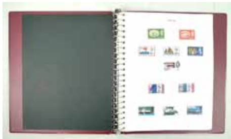
351 An album of GB mint stamps, thematic, comprising; maritime, aircraft, railways and road transport. £80 - £120