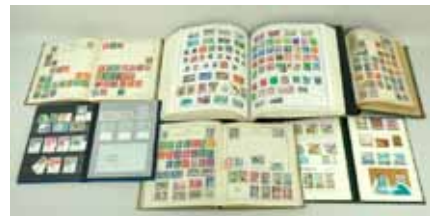
359 A collection of stamps including loose used and unused stamps from around the world, first day editions, Royal Mail mint stamps, sixteen stamp albums containing stamps from around the world, Stanley Gibbons The Swiftsure unused album, and the Stanley Gibbons 2005 edition of Collect British Stamps. £150 - £250