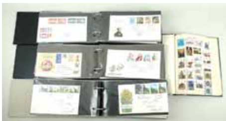
356 A Swiftsure stock album of GB and world stamps, and three albums of First Day Covers and mint stamps, 1970-80's. £40 - £60