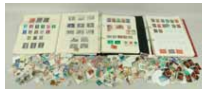
357 A collection of stamps from around the world including two Royal Mail stamp albums, four further albums and a quantity of loose stamps. £80 - £120