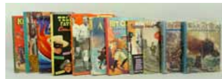
385 A Giles cartoon book 1943, two children's books by Herbert Strang and eight annuals. (11) £50 - £80