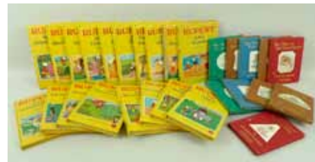
386 A collection of eighteen Rupert Little Bear Library Books, circa 1970, Sampson Law, Marston & Co Ltd, London, and ten Beatrix Potter books, Frederick Warne & Co, London. (28) £40 - £60