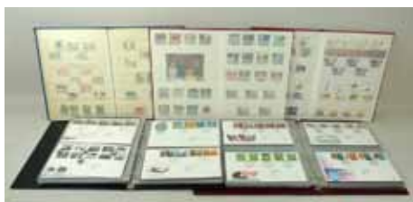
350 A group of five stamp albums, comprising; an album of 73 Royal Mail first day covers from 1977-2002, an album of 59 Royal Mail first day covers from 1991-1997, an album of 527 loose mint Royal Mail stamps, an album of 250 loose mint Royal Mail stamps, and an album of 174 mint and used stamps from around the world. £300 - £400