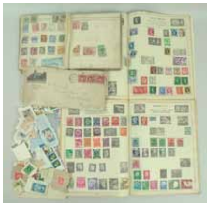
349 A quantity of GB and world stamps, mint and used, in albums and loose, together with Prince of Wales Hospital Fund stamps 1897 & 1898, a book 'Rare Stamps' by L N & M Williams, and a small quantity of coins including two five pound coins and seven George V Half Crowns. £40 - £60