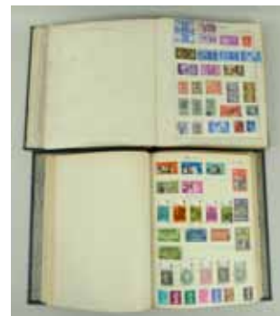
360 A pair of stamp albums containing general pre and post war stock, including China, Italian and world stamps. £40 - £60