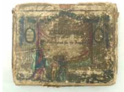
384 A Teleorama, early 19th century, 'Ein geschenk fur die Jugend', a twelve section concertina diorama of 'Anzicht Von Marmor Palace bei Potsdam', with a slip cover, 14.5 by 15.5cm £100 - £200