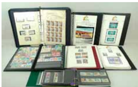
352 A collection of eight stamp albums containing first day covers. £100 - £200