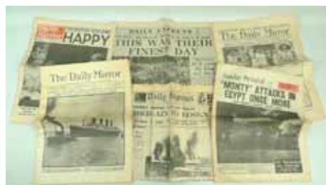
380 A group of early 20th century newspapers, comprising; The Daily Mirror, no 2,645, Tuesday April 16th 1912, front page 'Disaster to the Titanic', the Sunday Pictorial no 1,442, November 1st, 1942, front page title 'Monty Attacks in Egypt Once More', The Daily Mirror no 4,878 Monday June 16th 1919, titled Britain's Magnificent Atlantic Air Triumph, and The Daily Mirror Coronation Souvenir, no 15,412 Wednesday June 3rd 1953, front page titled 'Happy and Glorious'. (4) £30 - £50