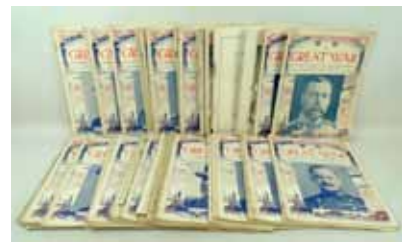
383 H W Wilson; The Great War, magazine format, issues 1-52. £100 - £150