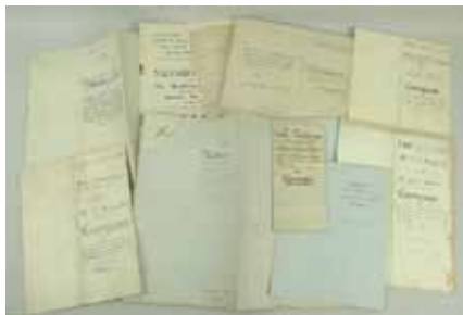
382 A group of conveyances and indentures relating chiefly to the Tinsley and Fremantle families in the County of Lincolnshire. £60 - £90