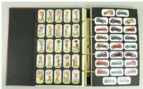
375 An album of The Card Collections Society cigarette cards. £60 - £80