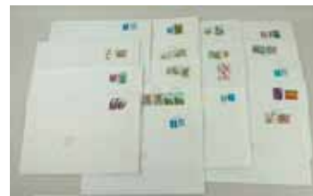
358 A quantity of GB First Day Covers on A4 envelopes. (156) £100 - £150