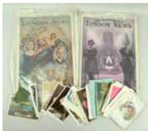
379 A group of late 19th/early 20th century postcards, The Illustrated London News, Royal Wedding Number, November 29, 1947, Vol 211 and The Illustrated London News Vol 220, 23 February 1952. £30 - £40