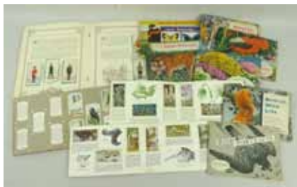
374 A quantity of cigarette cards including loose sets, Brook Bond Picture Card collection, four sets of Wild Woodbine cigarette cards, and a Military Uniforms of the British Empire Overseas Album. £30 - £40