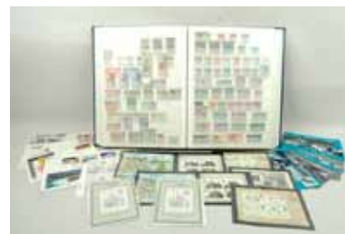
361 An album of George VI and Queen Elizabeth II GB and Dominion stamps, mint and used, together with sundry loose stamps. £60 - £80