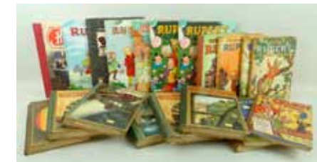
387 A quantity of children's Annuals and books including Puck Annual 1924, Bonzo's Story Book, Mickey Mouse Annual 1949, The Oojah Annual, eleven books from The Wonder Book series, Rupert Annuals, and Rainbow Annuals 1952-53. (38) £50 - £80