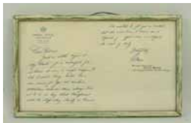
378 A letter to Doris Day written by the Writer-Director George Seaton, 17 by 29cm. £40 - £60