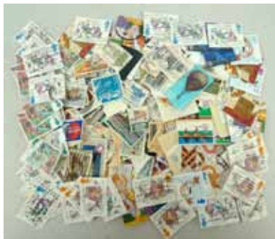
354 A quantity of GB and world stamps, used, late 20th century. £30 - £50